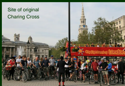
Site of original Charing Cross

The cycle route benefits from local knowledge all along the way. It takes in some of England's finest and most beautiful scenery and countryside, following over 700 years of history on safe roads and marked cycle routes .